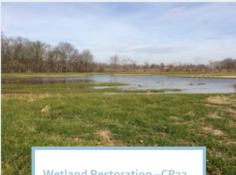
Wetland Restoration –CP23