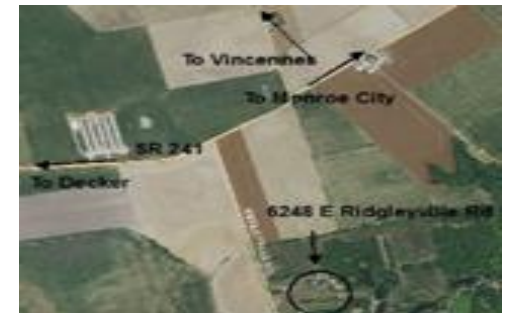
Map to event

The Knox County Soil and Water Conservation District formed five committees (Water Resource/Water Quality, Education, Wildlife, Ag/Soil Health, and Finance) in 2018 to assist in their function serving the Knox County residents by providing information about natural resource conservation, prioritizing local resource concerns, and enabling people to apply conservation practices and techniques. This event is being offered to you by the Wildlife Committee. The purpose of the wildlife committee is overseeing the district's efforts to improve and expand wildlife habitat in Knox County, by planning and hosting field days and training seminars, meeting with landowners to discuss habitat improvement, establishing relationships with wildlife organizations and bringing those resources to bear on Knox County lands, promoting CRP, CREP, WRE, WREP, and EQIP programs and providing educational presentations to schools and civic groups.