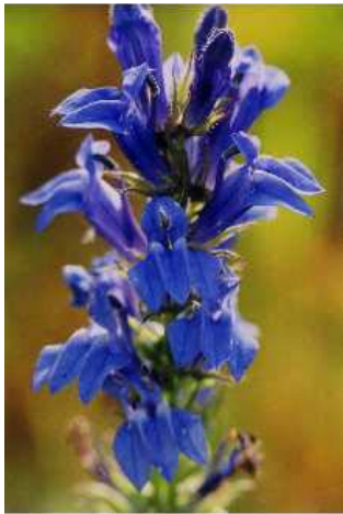
Great Blue Lobelia

Waters edge, full sun Good for rain garden