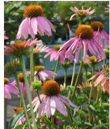
Purple Cone Flower

Waters edge, full sun Good for rain garden